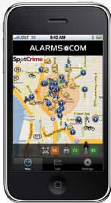
Download Free SpotCrime App providing local theft statistics and risk level for secure parking/safety tied to www.alarms.com

The new App should generate a lot of buzz because it provides a valuable free service – and it will be associated with www.alarms.com and by extension: your store! How's that for adding value to the Program!